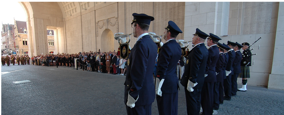
The buglers of the Last Post Association

This daily remembrance ceremony experiences a growing number of visitors and welcomes a number of approximately 200.000 à 250.000 visitors per year.